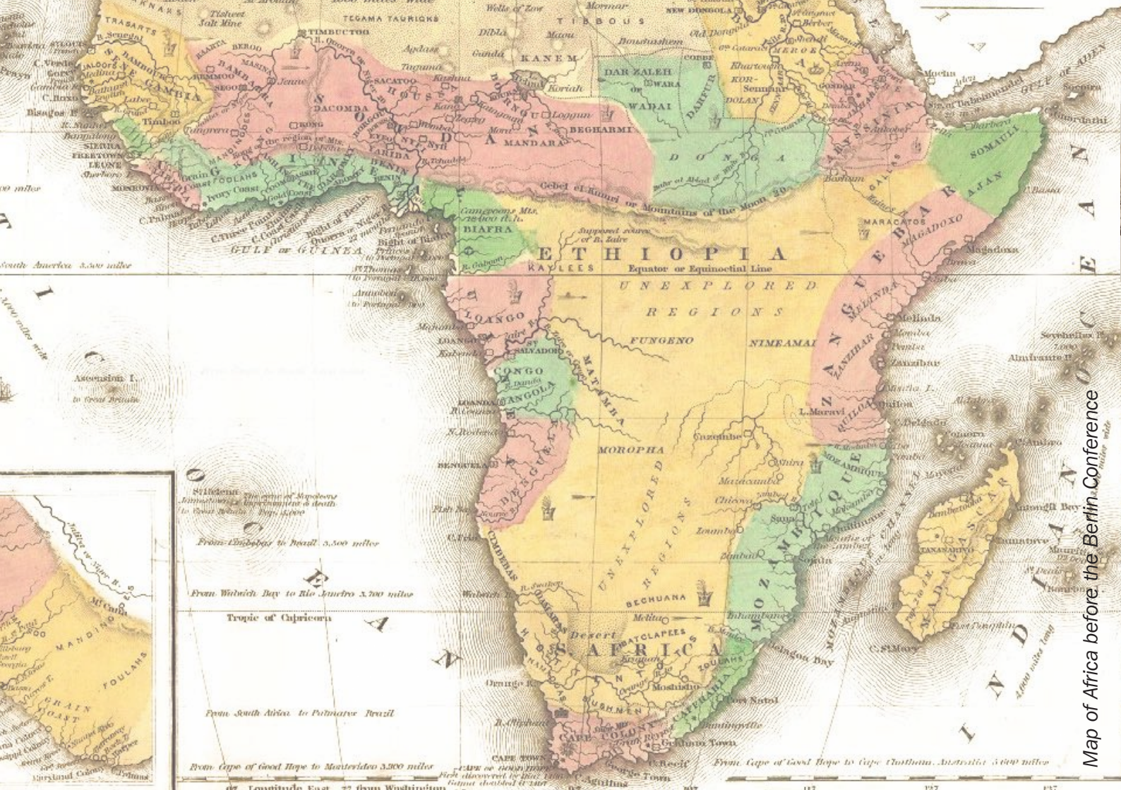
Map of Africa before the Berlin Conference