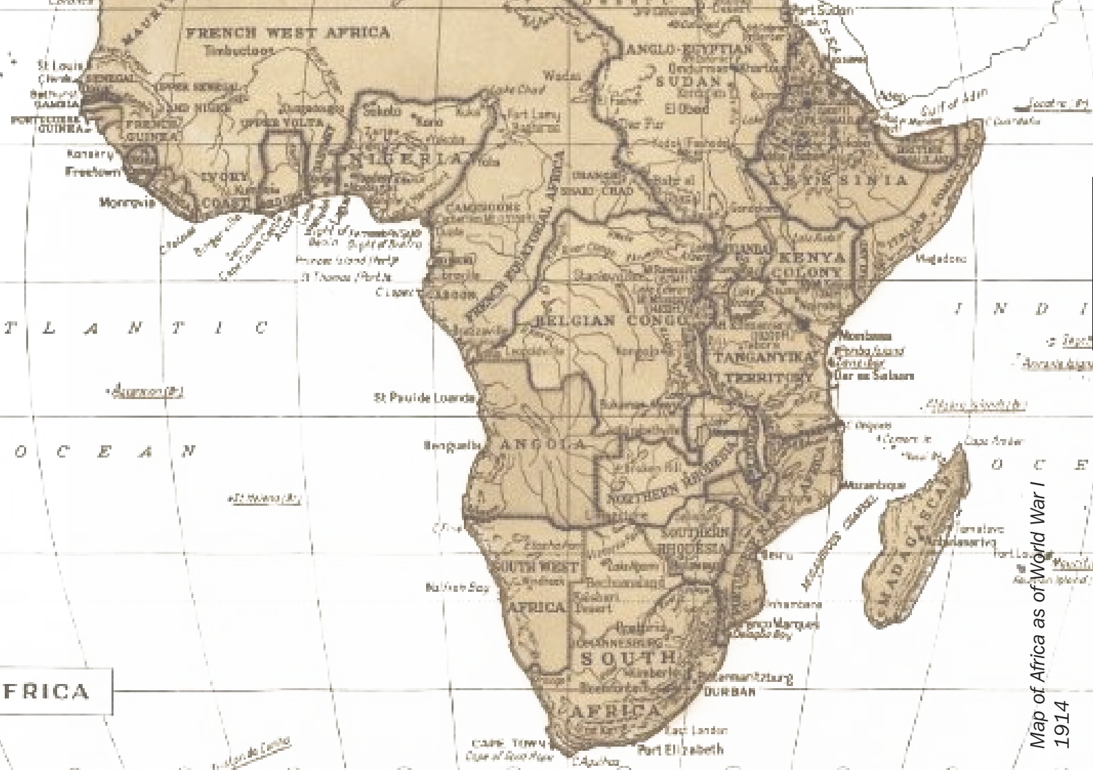
Map of Africa as of World War I 1914

The Cuamato people had gained fame of invincible after defeating the Portuguese in Mufilo in 1904, they forge alliances with the neighboring peoples knowing the Portuguese would come back for revenge.*